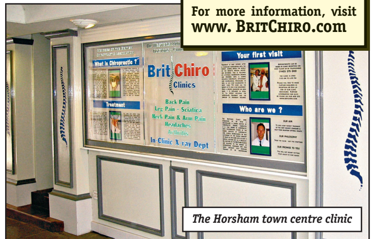
The Horsham town centre clinic

For more information, visit www. BRITCHIRO.com