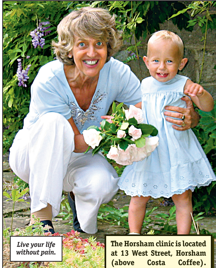
Live your life without pain.

Once a specific diagnosis has been made it is explained to you in detail including the